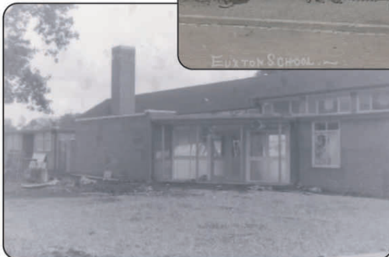
Euxton CE Primary shortly before opening