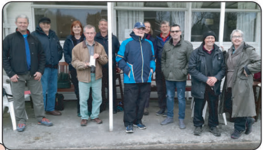
Above: Monday night teams first game in the League

If you want to follow the Bowling Club you can see its activities reported on its Facebook page, which is Facebook @EuxtonBowlingClub