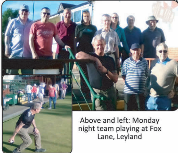
Above and left: Monday night team playing at Fox Lane, Leyland