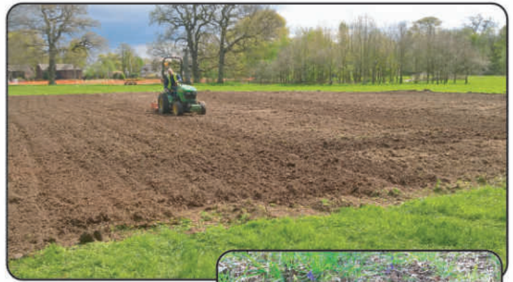
Top wildflower area

The pond has been completed, and at the time of going to print most of the planting had been done and the decking completed. There are some marginal pond planting still to be done, but these will be done before Summer.