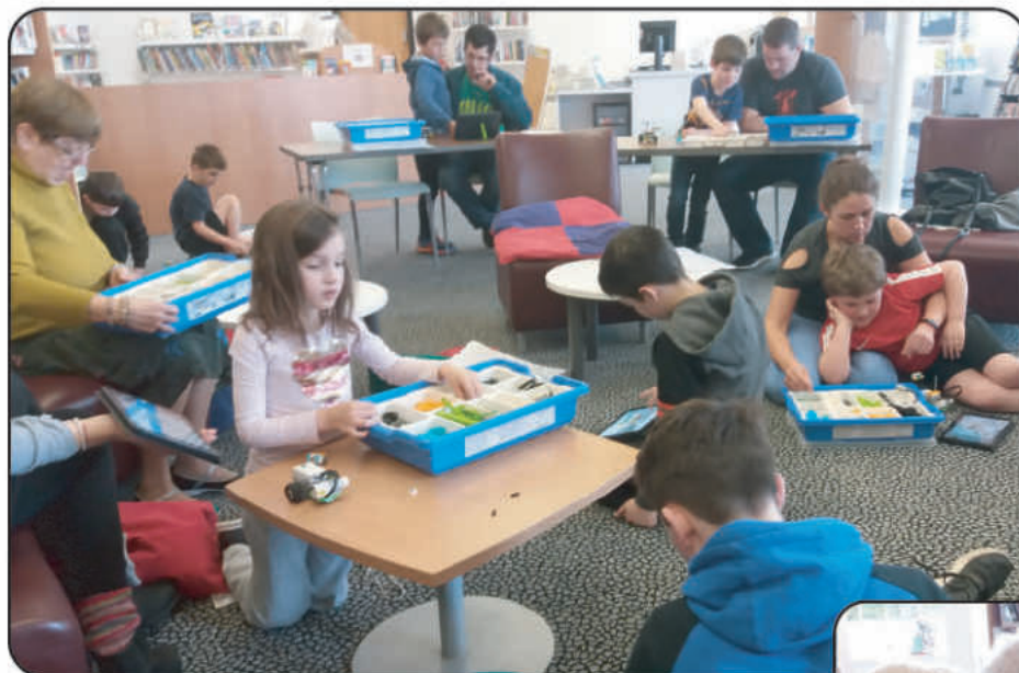
LEGO Robotics Session in the Library – run by a representative Lancashire Adult Learning – hoping for another session later in the year

Card Games Club – new club – every Monday afternoon : 2:00pm – 4:00pm – *all abilities welcome