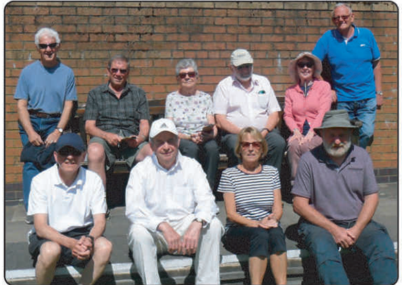
Below: Tuesday afternoon team playing at Fulwood

Eccleston Office 01257 451 673 Coppull Office 01257 794 588