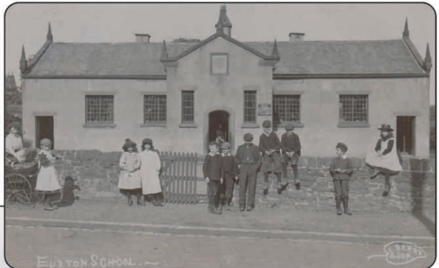
The school before it became the Community Centre, circa 1900s