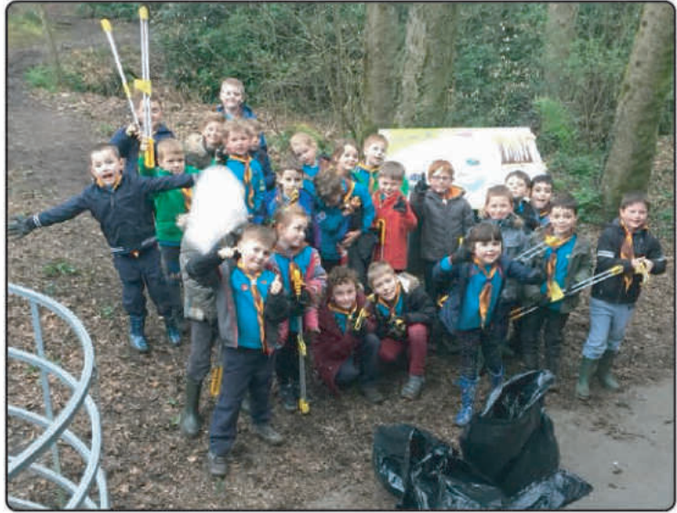
Euxton Methodist Beavers litter picking as part of their My World Challenge Badge

The Litter Picking events which happen via the Council Volunteer Kit can gain for the participants 'Spice Time Credits' and the family from Milestone Meadow used the credits for a trip to Blackpool - see comment below.